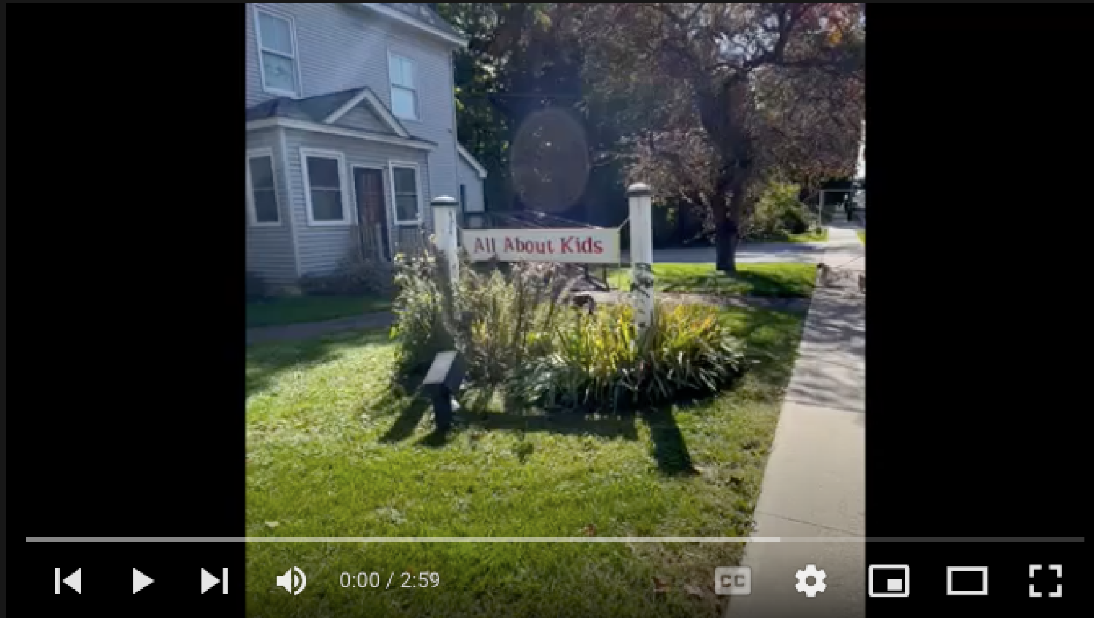
All About Kids Program Tour