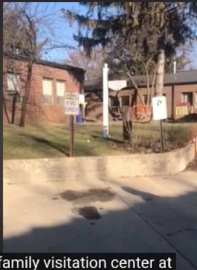
this is the family visitation center at Children's Home and Aid in Bloomington