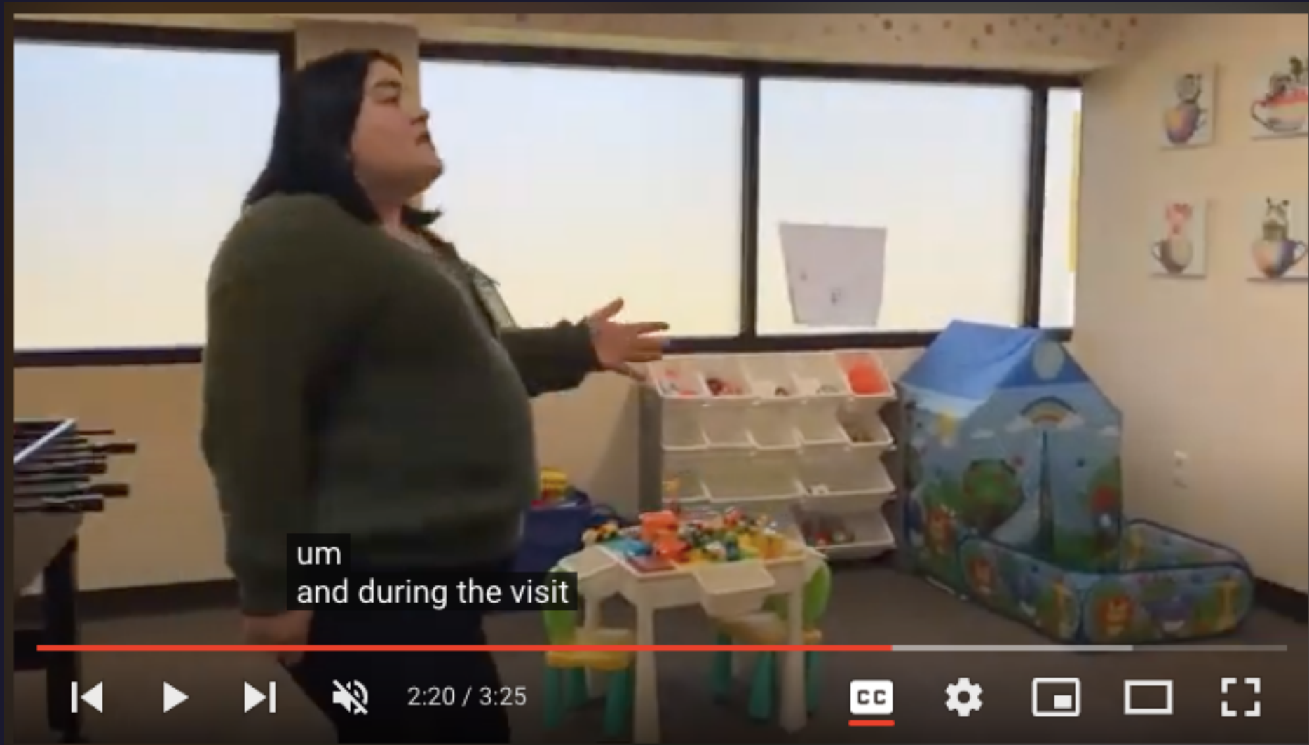
YWCA Knoxville-Tennessee Valley Oak Ridge Program Tour